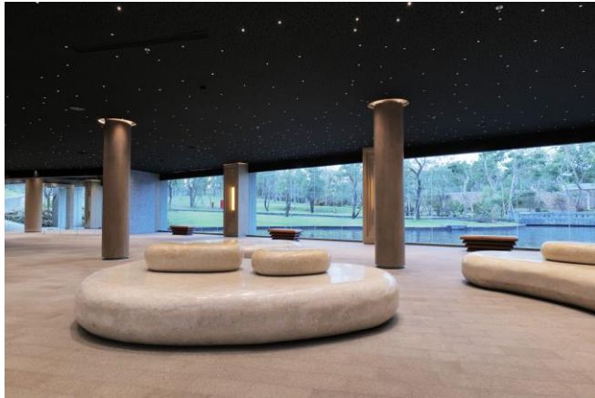
Above : Gallery view, art works can be appreciated against the backdrop of the surrounding nature.