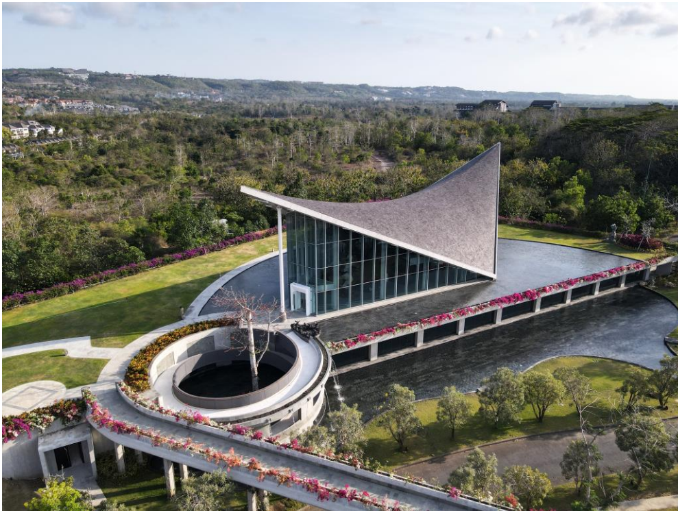
SAKA Museum surrounded by beautiful landscape.

This museum is designed to become a new destination, allowing visitors to appreciate the region's distinctive traditional art in a relaxing environment that is in harmony with the rich natural surroundings. We aimed to create a meditative space that stimulates the visitor's five senses by the wonder of experiencing art, the unique tropical landscape, and the surprises offered by the architecture.