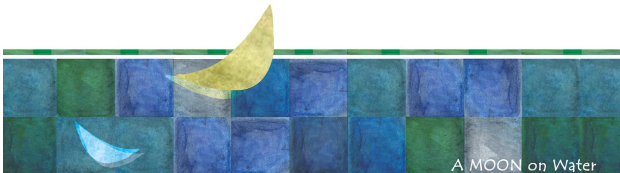
Conceptual image of A MOON on Water

At night, the building itself glows, gently illuminating its surroundings as a symbol of this resort such as the moon floating on the water.