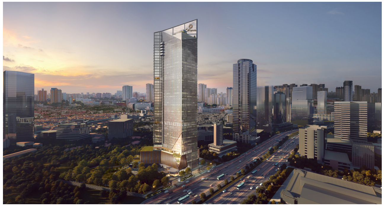
Front view from JI. Gatot Subroto

Mitsubishi Jisho Sekkei Inc. and Mitsubishi Jisho Sekkei Asia Pte. Ltd.